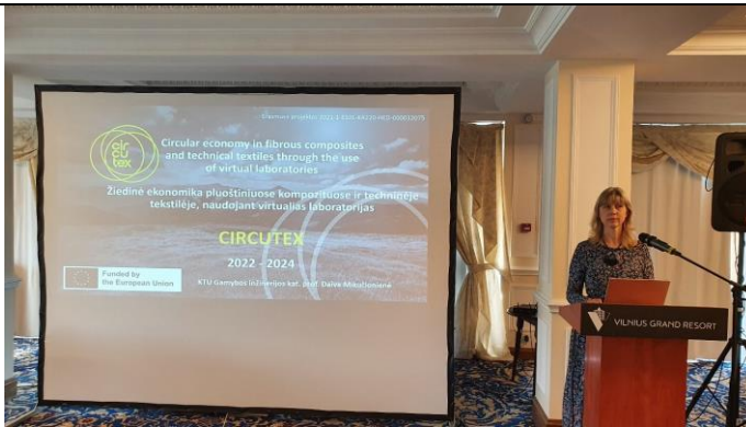
Image from the Annual Conference of LATIA