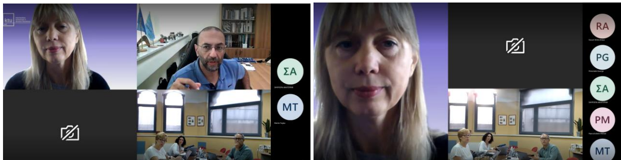
Images from the on-line meeting

Steps forward have been made before this meeting and this was an important occasion to discuss drafts and results of the hard work done so far. Partners had the chance to discuss and give feedback on the Dissemination, Intellectual Outputs evolution, Quality Plan . Plans and decision for the next upcoming months before the Face-to-face Transnational Meeting from Lithuania have been made.