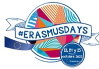
Image from Erasmus Days in UPV-Alcoy