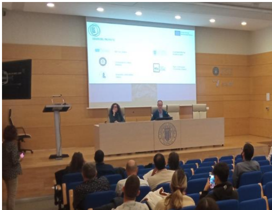
Image from conference "Europe - New Textile Projects for a new economy" in UPV-Valencia