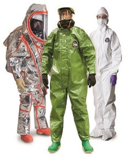
Fig. 2: Protective equipment in hostile environment [9]

Today, textiles serve in diverse and complexes areas, from life protection to surviving in hostile environment, leading to promotion of human health (Figure 2) and improvement of life quality.