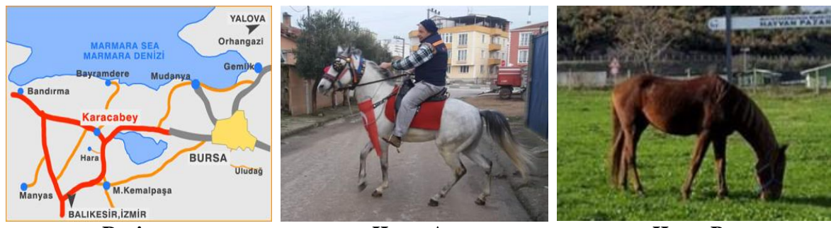
RegionHorse AHorse BFig. 2: Photos of utilized Arabian horses and supplied region map of the horses in Turkey

The horse hair fibers were rinsed with 50 °C water before evaluation. The color properties of the horse hair fibers were measured by using DataColor SpectraFlash 600 (DataColor SpectraFlash 600, Datacolor International, USA) spectrophotometer (D65 day light, 10° standard observer). The CIE L^* , a^* , b^* and C^* color coordinates [16] were measured and the K/S (color strength) values were calculated for each horse hair sample. Moreover, the reflectance curves were also obtained.