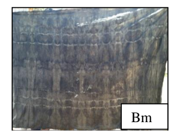
Fig. 6: Dyed with marigold flowers

Sample Bm was tie-dyed using sew-twisting techniques while sample Am entailed sandwiching technique; where parts tied are characterized by umbrella like shapes. As can be seen, sample Am gave intricate brighter lines than sample Bm. owing to the tightness during tying. However, for all samples dyed, the shades were dull as affirmed in natural dyeing of cotton substrates. Nonetheless cotton fabrics dyed with mukku natural dye gave brighter shades than fabrics dyed with marigold dye.