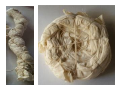
Fig. 1: Tied for Copper Sulphate mordanting