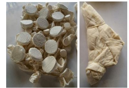
Fig. 2: Tied for hydrous Iron sulphate mordanting