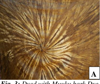
Fig. 3: Dyed with Muuku bark Dye

Dyeing with copper sulphate and anhydrous Iron Sulphate created beautiful shades of orangebrown and lighter black shades as shown in Fig. 3, Fig. 4, Fig. 5 and Fig. 6 respectively.