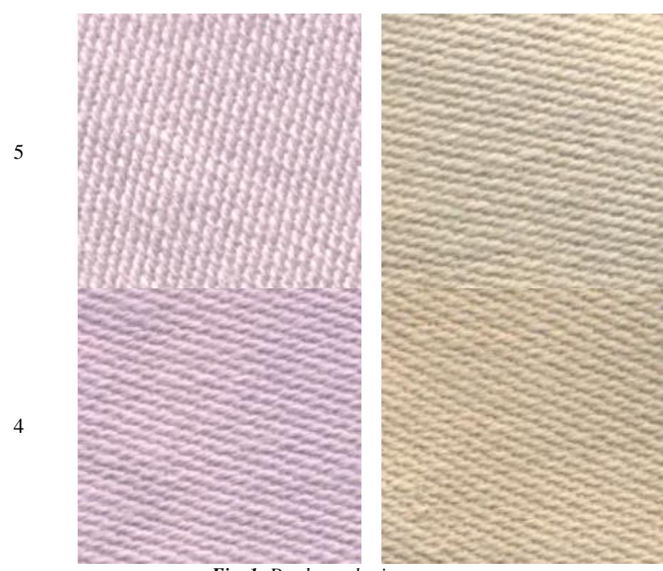
Fig. 1: Dyed samples images

Dyed samples using lower or higher temperatures show different colours, seeing that dyed samples at 95°C are pinker, however if the dye process is performed at 130°C, then colour samples are yellower. Moreover, there are some differences about the colour intensity of dyed samples using different pH in the process. To verify this fact, the spectofotometer results are analyzed.