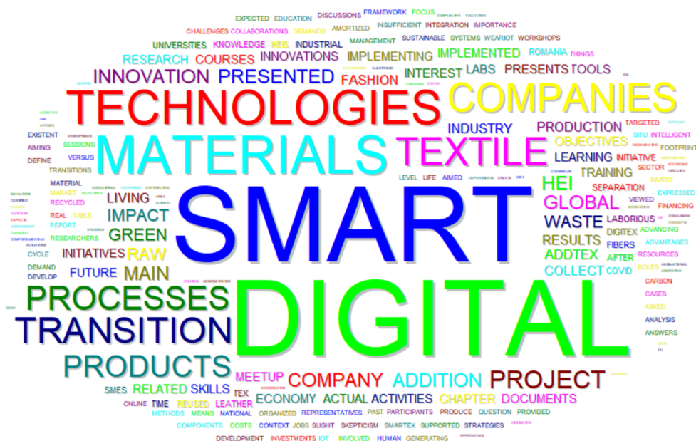
Fig. 1. Digital-Smart-Green transition based new technologies for advanced sustainable textiles

In the context of the green, digital and smart transition, several technologies/solutions have already been implemented by companies such as the use of recycling, waste management (selective collection of textile waste), energy from renewable resources (photovoltaic panels) and hybrid cars for product transport (Figure 1).