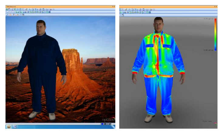
Fig. 5. Virtual try-on and verification of the customized protective clothing for men

For checking the body-product correspondence, the Tension Map function was applied, which renders the degree of ease/adjustment of the products on the bodies (fig. 4 and 5). For the female subject, the software reveals the information that the jacket corresponds dimensionally. Also, the chest and waist trousers fit on the waist line and are slightly wide on the hips line. The degree of ease is justified by the semi-rigid silhouette of the protective clothing. This information is useful for the pattern designer which could return to 2D patterns and introduce necessary corrections.