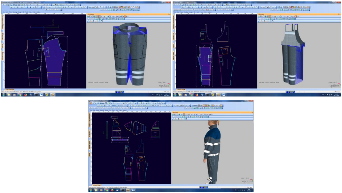
Fig. 2. The 2D patterns of the customized Overalls sit with seam lines and required characteristics of the textile material

• checking and modifying the 2D patterns to ensure the optimal fitting.